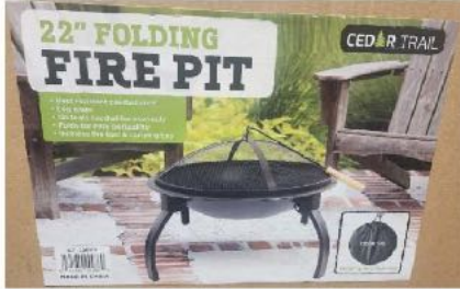
22" Folding Fire Pit, valued at $100.